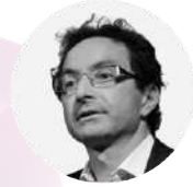
Michel HAÏSSAGUERRE Bordeaux - FRA